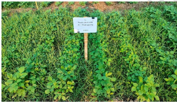
Fig 7. Weedy Check plot