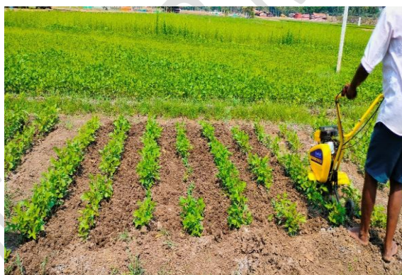
Fig3. Power operated weeding