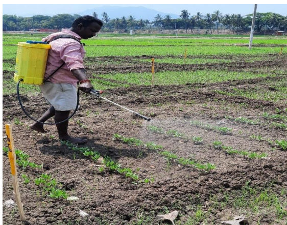
Fig2. EPoE application of Imazethapyr @ 100 g ha -1 +Quizalofop-ethyl @ 50 g ha -1 (Tank mix) at 20 DAS