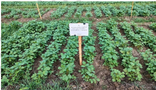
Fig 5. PE Pendimethalin 30% EC @ 1 kg ha -1 fb Power operated weeder at 20 DAS with 40 × 7.5 cm plant spacing (T 3 )

The results revealed that the integrated approach of pre-emergence application of Pendimethalin 30% EC @ 1 kg ha -1 followed by power operated weeder at 20 DAS with crop geometry of 40 × 7.5 cm was the best option to manage the weeds in summer irrigated blackgram to get higher grain yield (881 kg ha -1 ) with higher weed control efficiency due to the decreased competition to the plants by weeds at critical growth stages of the crop.