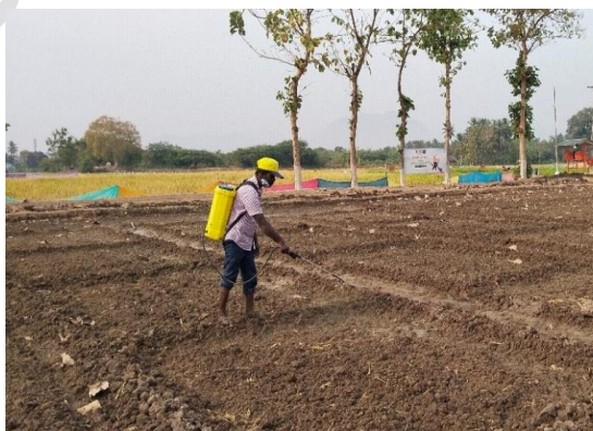
Fig1. PE application of Pendimethalin 30% EC @ 1 kg ha -1

Blackgram variety VBN 11 was used as a test variety for the experiment. For irrigated blackgram, the recommended fertilizer dose was 25 kg ha -1 N, 50 kg ha -1 P 2 O 5 , 25 kg ha -1 K 2 O and 40 kg ha -1 of sulphur, which were applied in the form of urea, single super phosphate and muriate of potash. The entire dose of fertilizers was applied at the time of sowing as basal. For irrigated blackgram, the seed rate of 20 kg ha -1 was used. Weed management was done as per the schedule of the treatments. PE and EPoE herbicides were applied with a spray fluid of 500 litres ha -1 using Knapsack battery operated hand sprayer in certain treatments at 3 DAS and 20 DAS respectively (Fig. 1 and Fig. 2). The power operated weeder (blade width of 30 cm) was used for removing weeds in certain treatments according to the intervals mentioned in the treatments (Fig. 3).