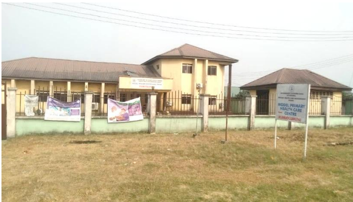
Figure 3: Primary Health Centre at Nkpor Neighbourhood