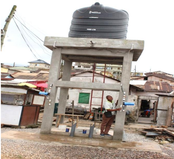
Figure 4: Private Borehole at Mgbushimini Neighbourhood as Source of Water Supply