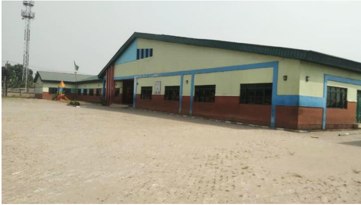
Figure 2: Public Secondary School at Mgbushimini Neighbourhood Source: Researchers' Survey, 2022