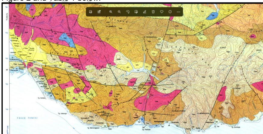
Figure 1. Geological Map of the City of Gorontalo and its Surroundings (Apandi and Bachri, 1997)

Gorontalo City is dominantly located in the lake sediment formation which unconformity overlaps older rock formations in the Gorontalo area. In detail, the types of soil in each district are shown in Figure 1, Figure 2 and Table 1 below.