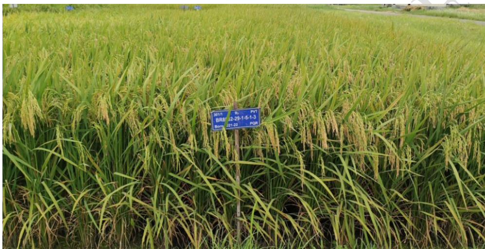
Fig. 1. Pictorial view of BR8862-29-1-5-1-3 (BRRi dhan104) in the field condition

After proper evaluation by the National Seed Board of Bangladesh (NSB) in the ten locations of farmers' field of Bangladesh, BR8862-29-1-5-1-3 has been released as BRRi dhan104 in the year 2022. The pictorial view of BRRi dhan104 in the field condition with its grain, rice are shown in figure 1 and 2.