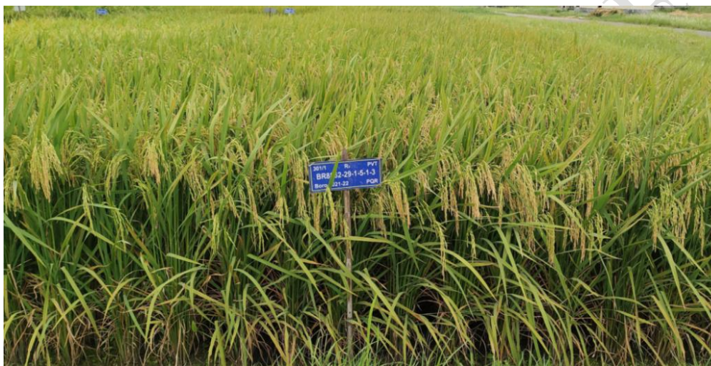
Fig. 1. Pictorial view of BR8862-29-1-5-1-3 (BRRi dhan104) in the field condition

After proper evaluation by the National Seed Board of Bangladesh (NSB) in the ten locations of farmers' field of Bangladesh, BR8862-29-1-5-1-3 has been released as BRRi dhan104 in the year 2022. The pictorial view of BRRi dhan104 in the field condition with its grain, rice are shown in figure 1 and 2.