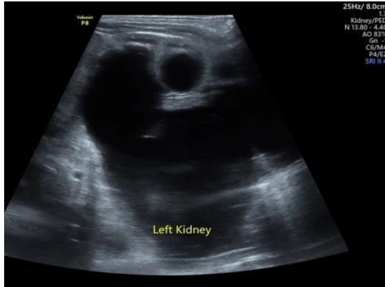
Figure 2: USG kub showing left gross Hun