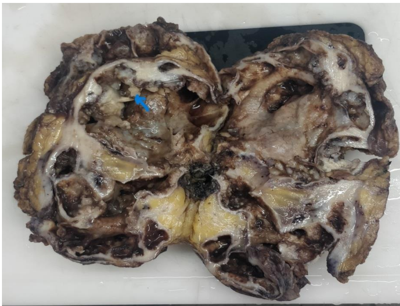
Figure 5: Image of cut surface of the kidney showing markedly dilated renal pelvis with foci of nodular excrescences(arrow) in the wall.