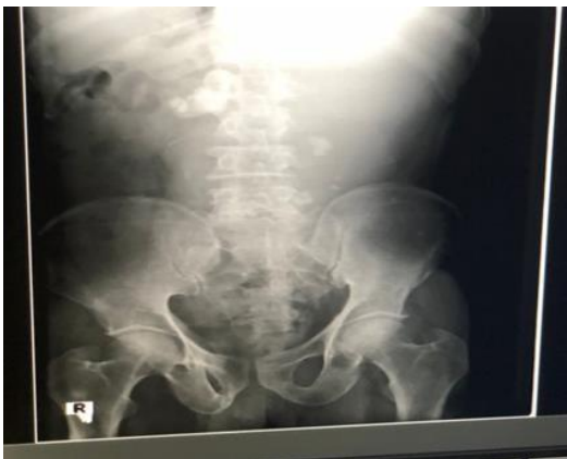
Figure 1: X-ray KUB showing left renal calculus