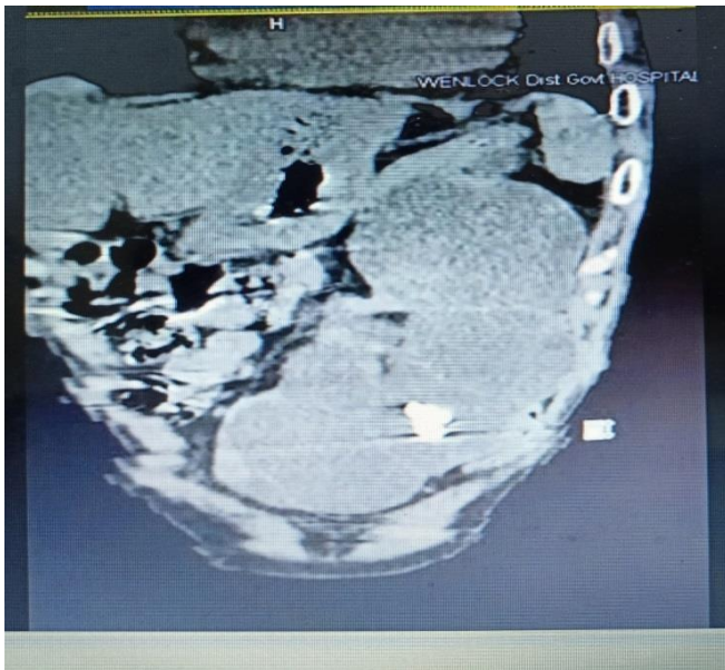
Figure 3: NCCT KUB