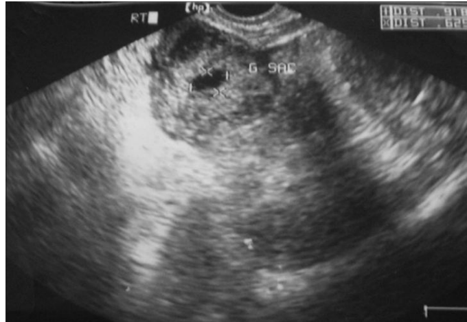
Figure 1: TVS ultrasonography showing ectopic gestation