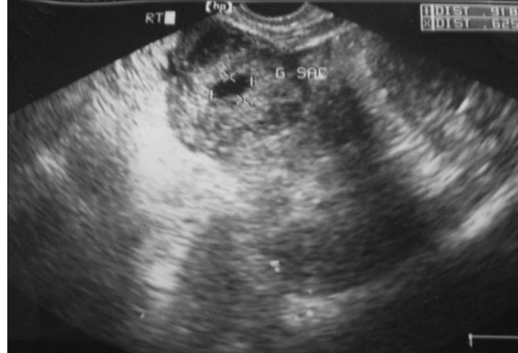
Figure 1: TVS Ultrasonogram showing ectopic gestation

histopathological examination, trophoblastic villi and corpus luteum embedded in the ovarian tissue were seen, which were confirmatory of primary ovarian pregnancy (Figure 2).