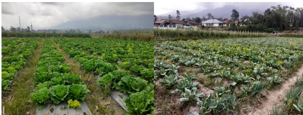
Figure 1. Field condition of locations

The synthetic pesticide was used for controlling pests and diseases. Generally, the application was conducted in three weeks after planting and applied one time in a week. If rain intensity was high, the application was conducted more than one time in a week. The farmers always mixed several different types of chemicals in application time.