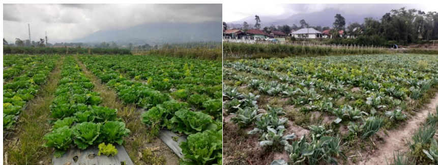
Figure 1. Field condition of location

conducted conventionally. In early tillage, the manure was used before seedling planting and then, the fertilization twice, in early week of planting and 30 days after planting.