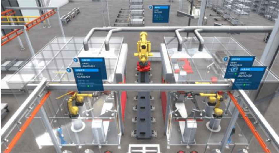
Fig. 2: Process design mode driven by digital twinning

and intelligent control to improve the efficiency and performance of the control system. In general, the application of digital twin technology can bring brand new ideas and methods for the design, debugging and operation mode of control system, which requires continuous exploration and breakthrough in the aspects of technology, standard and application.