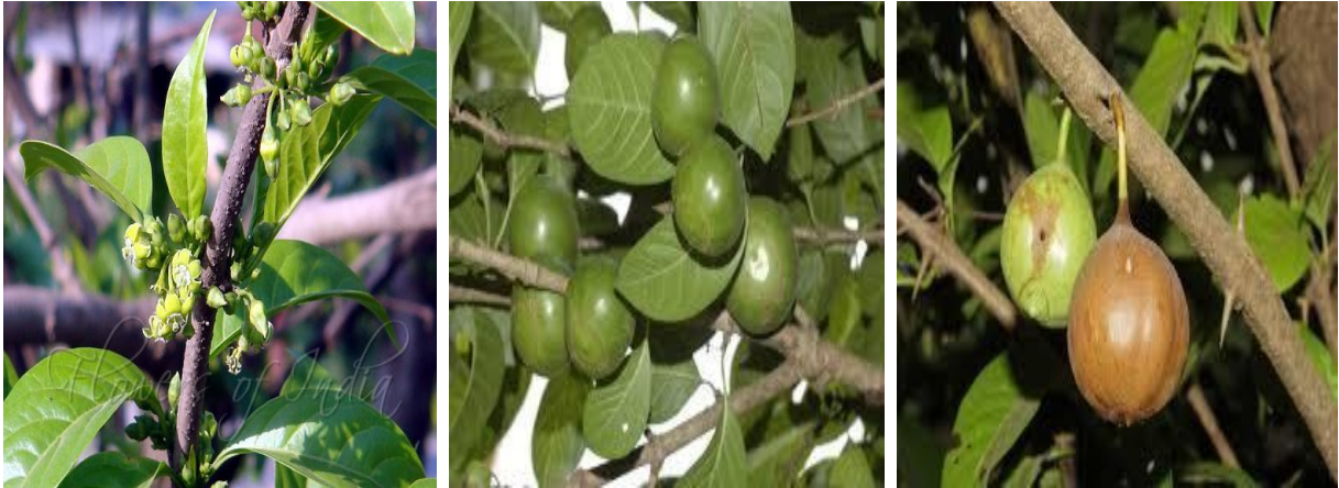
Figure 2: Meyna laxiflora Robyns Fruit [39]

Meyna laxiflora Robyns fruit, commonly known as Alu or Huloo (Marathi), muduna (Hindi, Bengali), manakkarai (Tamil), muyna, and gobergally (Kannada), and its name depending on the territory ( Table 3. ). The fruit is 2.5 cm long, brown chocolate color when ripe – green in the unripe stage, and contains 5-6 seeds and fruit segments. The flowering and fruiting seasons are on January - July in Maharashtra and November- December in Manipur [40, 41]. The ripe fruit is fleshy slightly sour, sweet, and soft. Fruits are rich in carbohydrates, vitamins, proteins, and minerals like calcium, iodine, iron etc. The fruit contains the highest amount of potassium (1278 mg/100 gm), calcium (325 mg/100 gm), iodine , etc. It is more highly rich in iron than other wild fruits i.e., about 35 mg per 100 gm fruit [25, 42]. The mineral composition and antinutritional factor from wild edible fruits from Kolhapur district were carried by Valvi et al. (2011a) and Rathod et al. (2011), Meyna laxiflora Robyns fruit is become on and the results showed that this fruit is rich in Iron and Saponin. Fresh and young fruits are consumed as a vegetable in cooked form. Dried fruits are narcotic and are used for the treatment of dysentery. Ripe fruits are eaten as food when it's raw and is also sold in the market when its ripe and ripe fruits are also dried after applying salt and kept in plastic bags [25]. The regional names of the Meyna fruit are reported in table no 3.