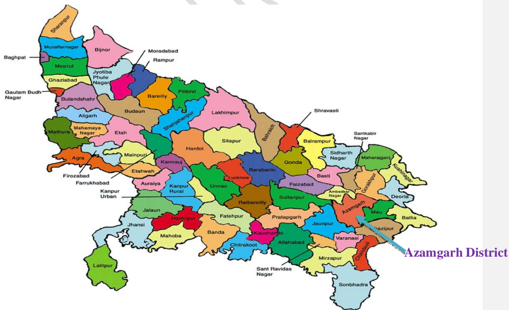
Fig: 1 Location of study area Azamgarh District

Comment [E2]: Is it possible to write all locations in English language as the article is written in English.