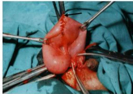
Figure 3 – Wedge resection with Meckel's diverticulectomy

Then the child was kept on intravenous fluids along with antibiotics. The surgically resected specimen was sent for histopathology laboratory & microscopic finding confirmed that it was Meckel's Diverticulum and no heterotopic tissue was found. Oral feeds were started 48 hrs. After the Surgery the child did well without any complications and was discharged home on the seventh post-operative day and on clinical follow up he is doing well since last 25 years.