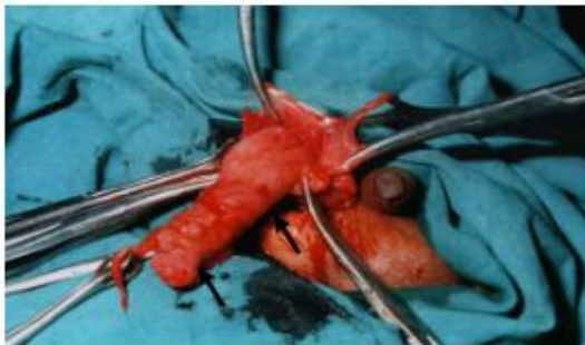
Figure 1 – Meckel's Diverticulam in a Right. Inguinal hernia (Litter's hernia)

A 3 years boy was brought to Jatal Hospital and Research Centre, Latur in 1997 with complaints of swelling in right inguinal region since 1 year. On clinical examination, an irreducible painless swelling in right Inguinal region. The abdomen was soft and on Ultrasonography revealed small bowel in the hernial sac. The baby was admitted for hernia surgery. Then surgery was planned and performed through right inguinal incision, inguinal canal was opened and Spermatic cord was identified along with hernial sac(Figure1).