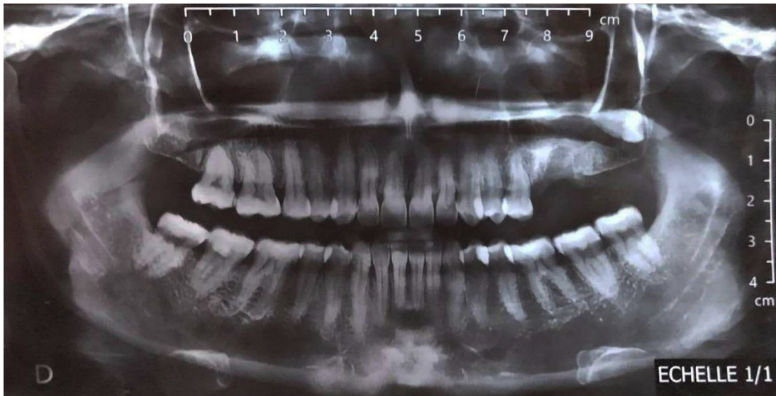
Fig1: Preoperative panoramic radiograph of an ectopic eruption of the left maxillary third molar into the left maxillary sinus.

A second radiographic scan, this time using cone beam computed tomography (CBCT), revealed the precise site of the third maxillary molar. CBCT showed the ectopic third molar located in the posteroinferior aspect of the sinus deported on the palatal side and in a horizontal position with a close approximation to the lateral wall of the sinus (Fig 2a, fig2b).