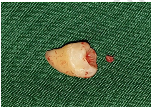
Fig4: Tooth after the operation.

The left maxillary sinus was thoroughly irrigated with normal saline. The mucoperiosteal flap was repositioned and sutured.