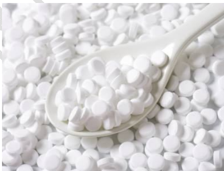
Figure.1 Mini Tablets

The EMA pediatric guideline suggests that small tablets, also known as mini-tablets, can enhance dosing flexibility and acceptability in children.(4) However, there is currently no clear definition of what constitutes a small tablet, although a proposed limit of 5 mm is under consideration for public feedback. The guideline emphasizes that the suitability of small tablets should be determined based on the child's health condition, disease progression, and the potential risks of swallowing, choking, aspiration, over-dosing, and under-dosing. Research has shown that 4-mm uncoated mini-tablets are appropriate for children from 1 year of age, while smaller 2-mm mini-tablets can be used in infants as young as 6 months old. Furthermore, 2-mm rapidly dissolving mini-tablets may even be suitable for pre-term infants. Mini-tablets have been found to be as well accepted or even better accepted than oral syrups in some studies.