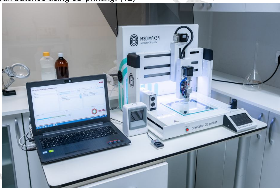
Figure.3 FabRx's pharmaceutical 3D printer for personalised medicines, M3DIMAKER

Furthermore, 3D printing's short-run properties are well-suited to patient-specific drugs, which are becoming increasingly popular as personalized medicine becomes more prevalent. The technology can also accelerate the clinical trial process by rapidly producing small batches of drugs with varying compositions. Companies can create multiple versions of a drug for different populations and manufacture them in short-run batches using 3D printing. (12)