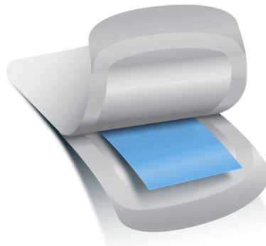
Figure. 2 Orodispersible Film (10)