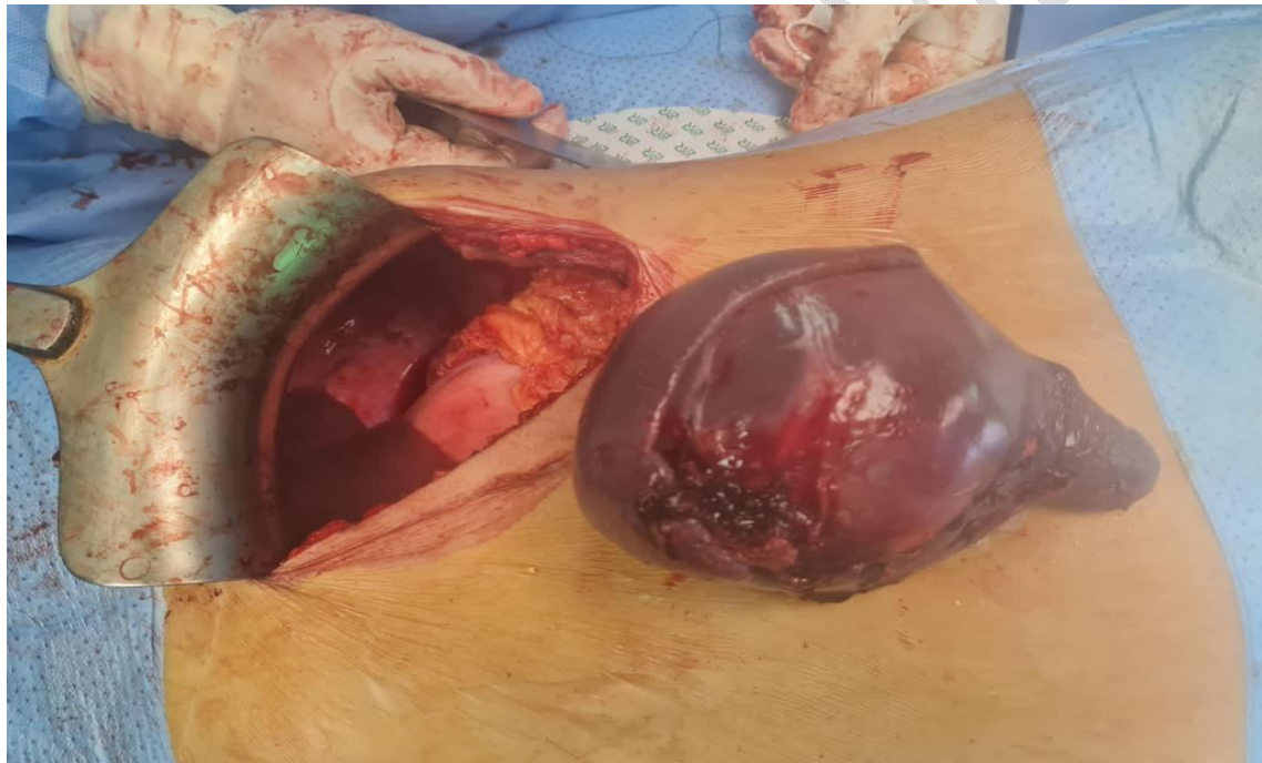
Figure 1 : Total splenectomy. and the cystic lesion has been completely removed.