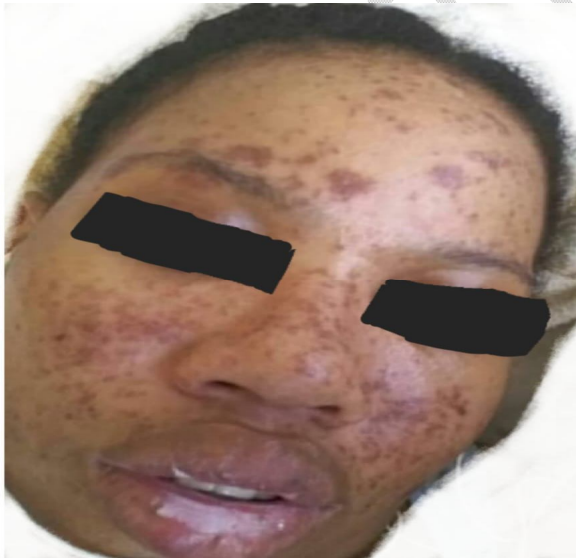
Figure 1b. In the early phase of the disease, the patient presented with crusted blistering (red spots) on the face, marked at the malar area (Malar rash) spreading to nasolabial folds, and swollen lips.