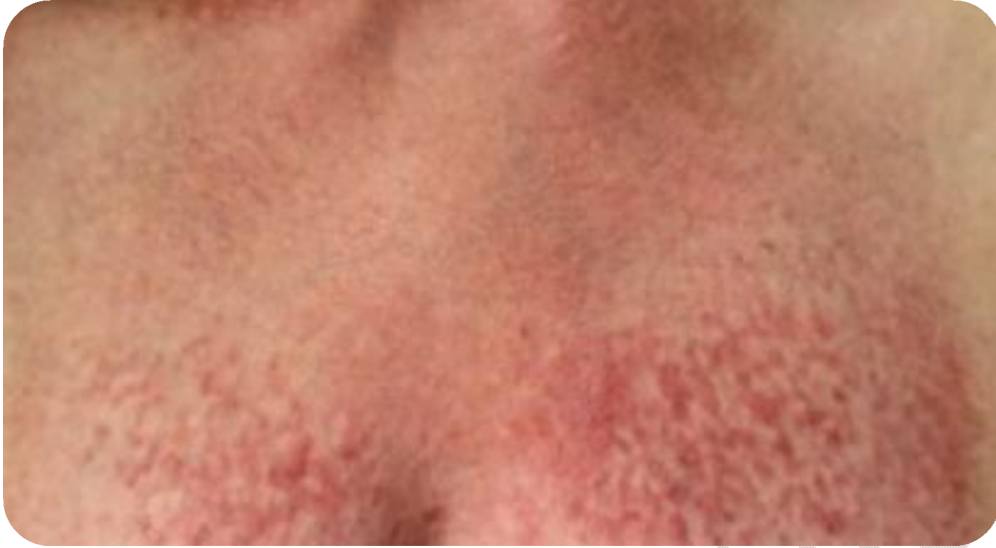
Figure 1a. The patient presented with shallow, crusted blistering in the neck and chest regions (Shawl's sign)—courtesy: Caribbean kidney and medical center, Saint Vincent and the Grenadines.