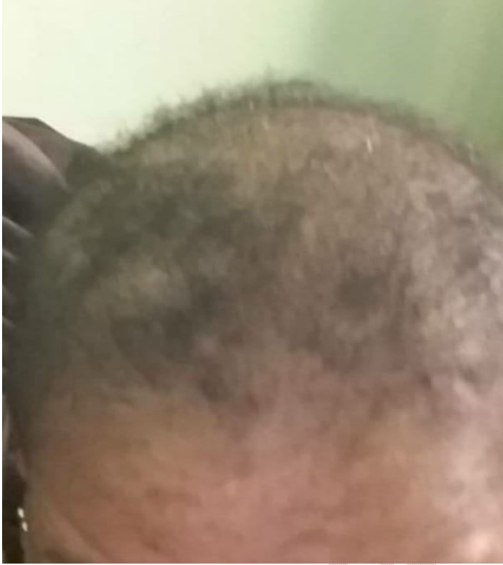
Figure 1c. The patient presented with spatial hair loss seven months after the disease onset (alopecia).