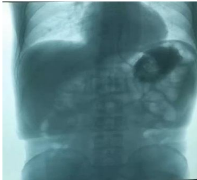
Fig .3Abdominal X-ray 7 days after surgeryFig .4Abdominal X-ray 13 days after surgery