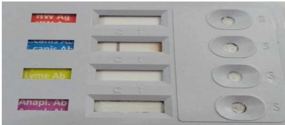
Fig. (3): Negative E. canis test for detection of Canine Ehrlichiosis.