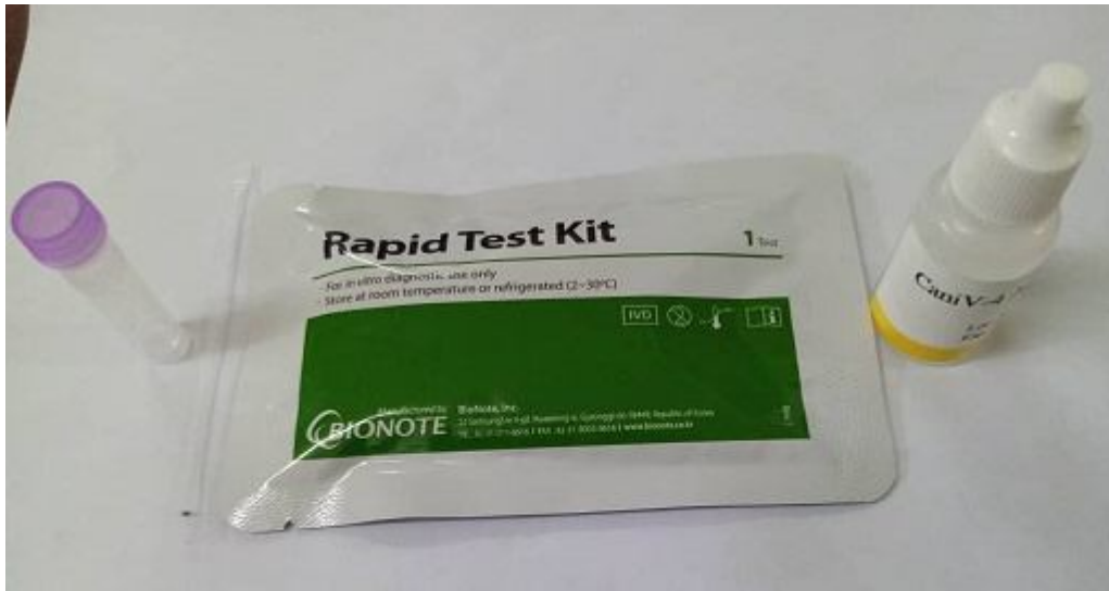
Fig.(1): Rapid Test Kit for detection of Canine Ehrlichiosis.