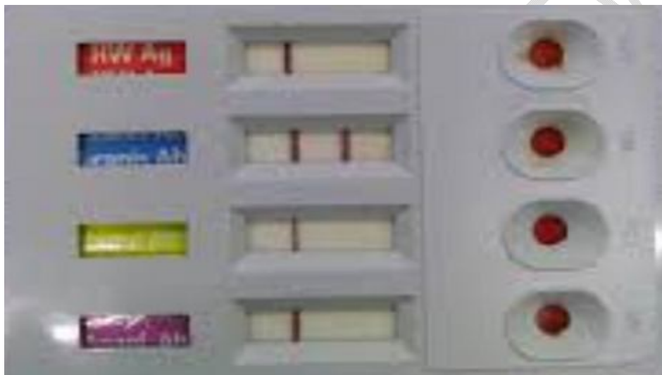
Fig. (1): Positive E. canis test for detection of Canine Ehrlichiosis.