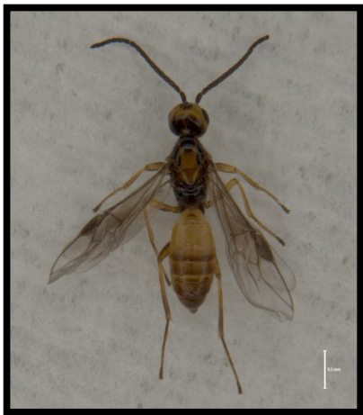
Bracon brevicornis (Wesmael)