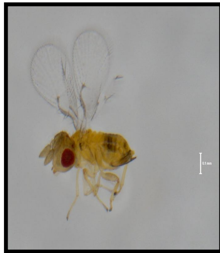
Trichogramma chilonis Ishii