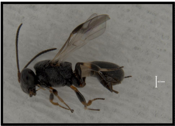
Chelonus blackburni (Cameron)