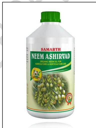
Neem oil (0.5%)

Plate 2. Parasitoids of bhendi fruit borer a. Bracon brevicornis b. Trichogramma chilonis c. Chelonus blackburni d. botanical (Neem oil (0.5%))