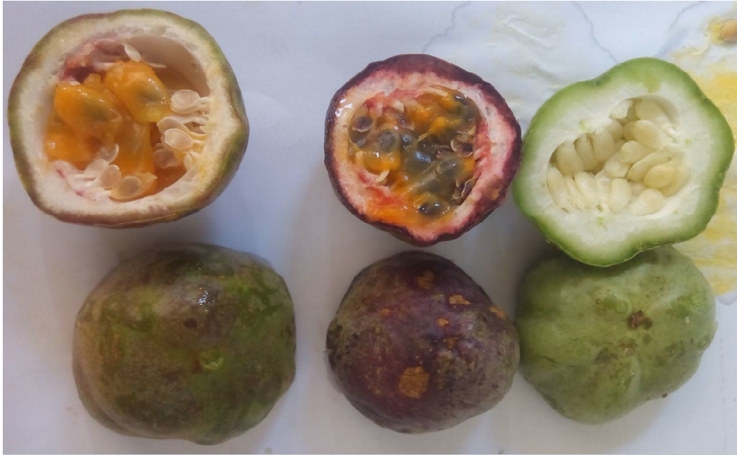
Figure 2: Effects of diseased passion fruits in Uasin Gishu County in the year 2017

Passion fruit is one of the crops which is capital intensive at the initial stages. Farmers in Uasin-Gishu reported that lack of information on agronomic practices in passion fruit production was believed to be contributing to the declining yields and related challenges facing the farmers. Apart from the cost of managing the crop, information on passion fruit production practices is limited and farmers chuckle around related information to increase yields.