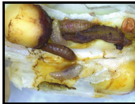
Bracon brevicornis parasitised Earias vittella larvae