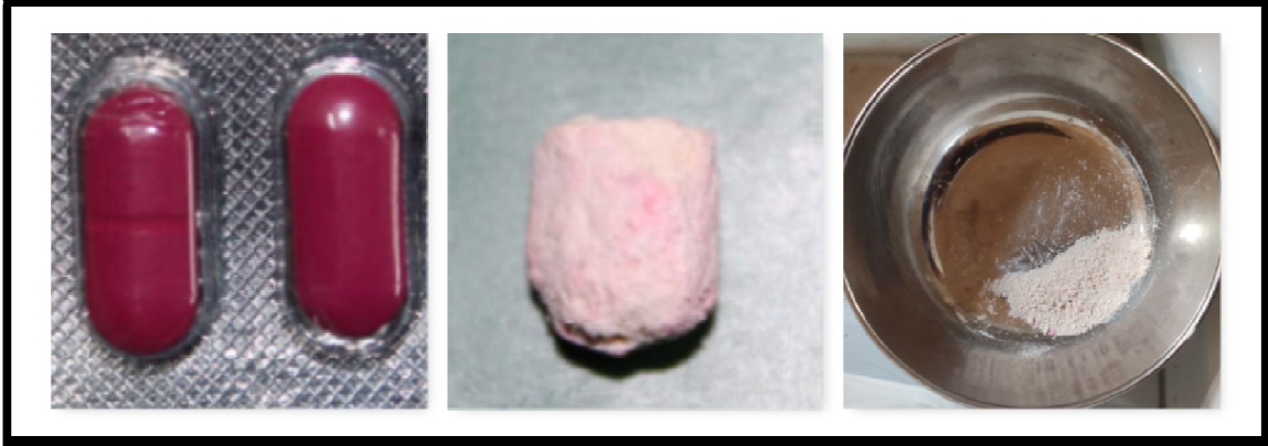
Figure 1: TRANSET MF precrushed tablet