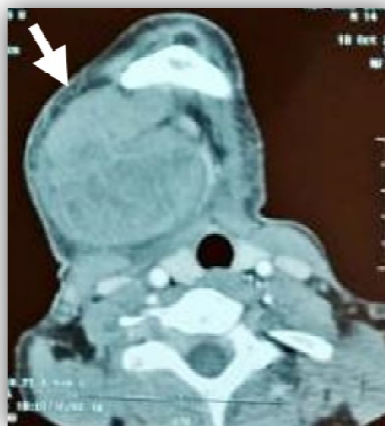
Fig. 3. CT scan results showing tumor-like right latero-cervical formation

The CT scan revealed a tumor-like right latero-cervical formation, measuring (67x65x96.8) mm, well defined, heterodense, site of calcifications, heterogeneously enhanced after injection of PDC ( Figure 3 ).