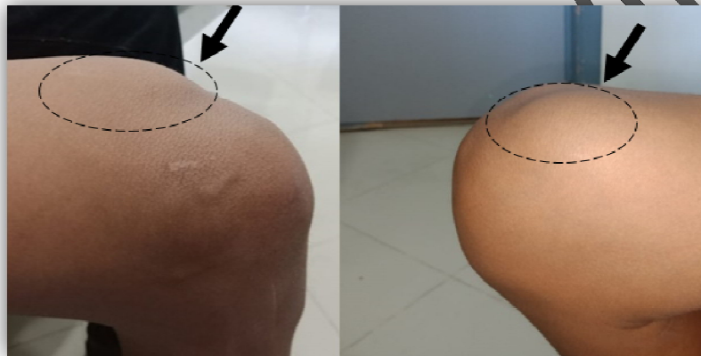
Fig. 2. Venous malformation of the lower end of the right thigh

The CT scan revealed a tumor-like right latero-cervical formation, measuring (67x65x96.8) mm, well defined, heterodense, site of calcifications, heterogeneously enhanced after injection of PDC ( Figure 3 ).