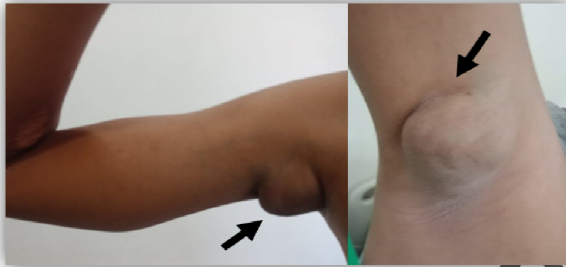
Fig. 1. Venous malformation of the right axilla