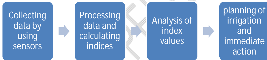
Fig. 2 Series of collection and analysis of data