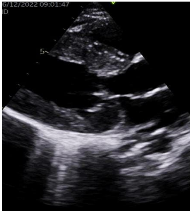
Figure 2: Parasternal long axis view revealed thickened left ventricular walls