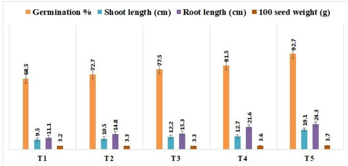
Fig. 3. Effect of foliar application of macro and micronutrients on germination and seedling parameters of rice fallow Blackgram variety, ADT3.