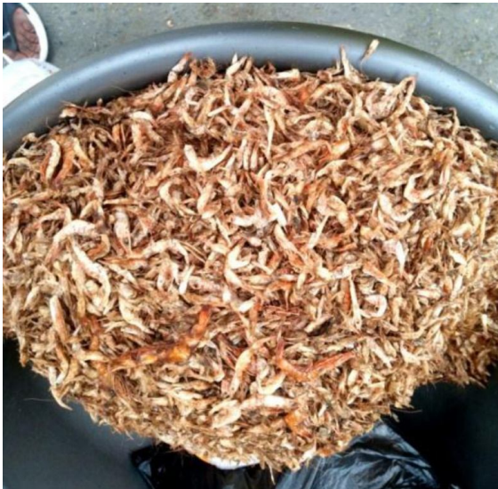
FIG. 1: Picture showing white shrimp ( N. hastatus )

incubated at 37°C for about 6-7 hours as enrichment medium. The suspension of homogenized tissue was serially diluted 10-fold using normal saline then 0.5mL of the appropriate dilution was spread over a freshly prepared Thiosulfate Citrate Bile-Salt Sucrose (TCBS) Agar plate and MacConkey Agar plate, using a sterile bent spreader. The plates were incubated at 37°C for 18-24 hours. After incubation, the incubated plates were observed for characteristic colonies. Each colony, distinguished mainly by colour and size, was counted and results were also recorded. Then discrete representatives of each colony type were randomly selected for purification, characterization and identification using conventional biochemical tests.