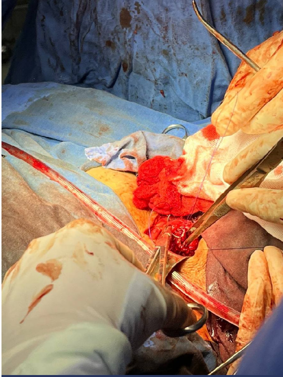
Figure 4. Gastric-esophageal hand sewn anastomosis in 1 layer with PDS-3-0