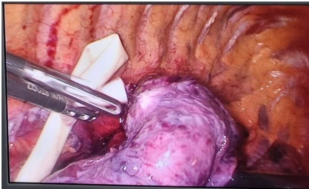
Figure 2. Esophageal dissection