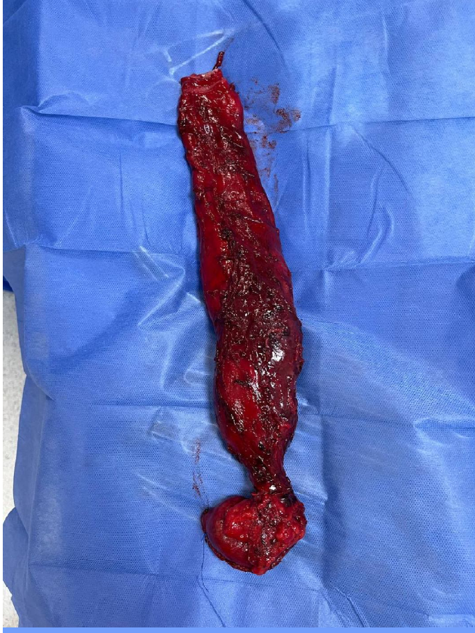
Figure 3. Surgical specimen resected esophagus from its cervical portion to the esophagogastric junction