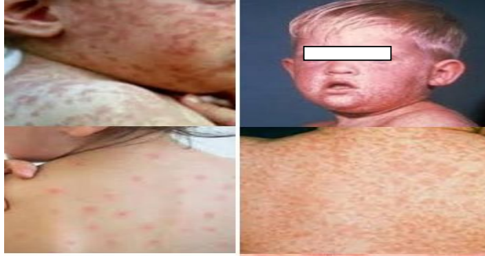
Fig 2: The images of monkeypox