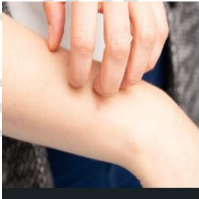
Fig 4. Predicted result of non-monkey pox detected

Predicting result: Monkeypox detected/ non detected