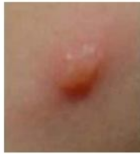
Fig 3: The predicted result of monkeypox detected