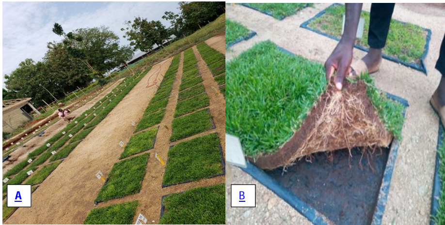
Plate1: A; a view of the study site and experimental layout. B; harvesting of sod.