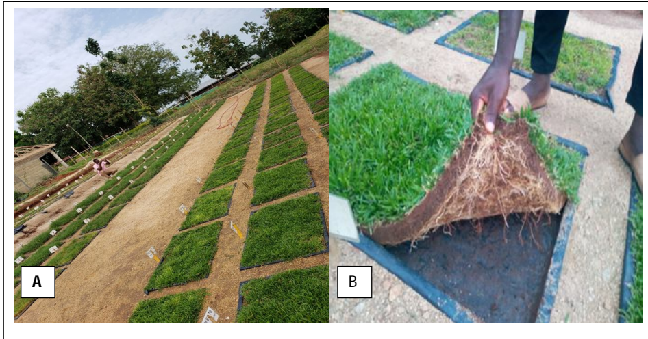
Plate1: A; a view of the study site and experimental layout. B; harvesting of sod.