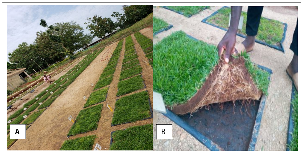
Plate1: A; a view of the study site and experimental layout. B; harvesting of sod.