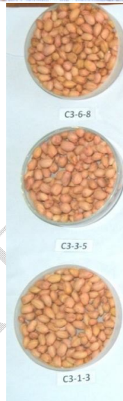
Figure 2 Selected superior plants for yield traits