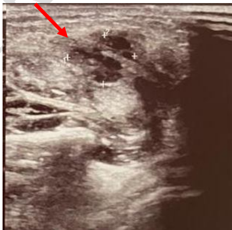
Figure 2: Ultrasound image showing hypoechoic lesion of the right parotid gland with