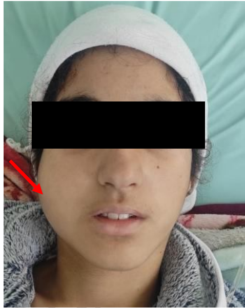
Figure 1: Clinical picture showing tumefaction of the right parotid

The initial Blood tests found an elevated C-reactive protein CRP 177 mg/dL and neutrophilia 9850 / \mu L. Pus was exuded from right Stensen's duct on compression of the gland externally yielding 3cc of purulent material. Bacterial cultures didn't identify any organism on gram stain and culture. The patient was treated with intravenous antibiotics (amoxicillin/clavulanate) for 4 weeks then switched to oral antibiotic for 2 weeks. She achieved a total of 6 weeks antibiotic. After discharge, there was a noticeable clinical improvement, biological parameters normalized and abscess disappear on the ultrasound. (Figure 4)