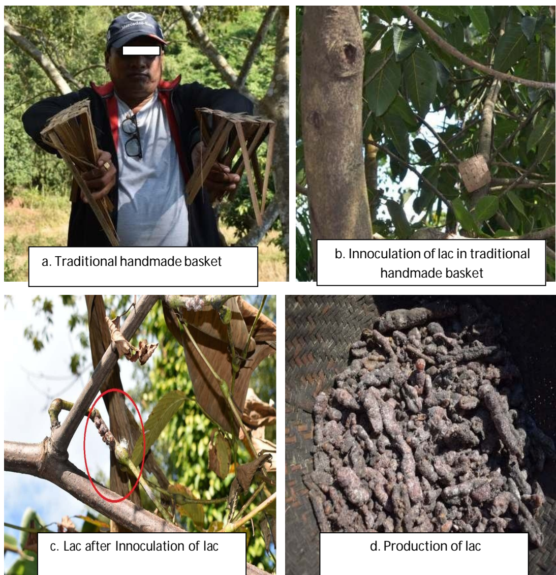
Figure 2. Production of lac in West Karbi Anglong District