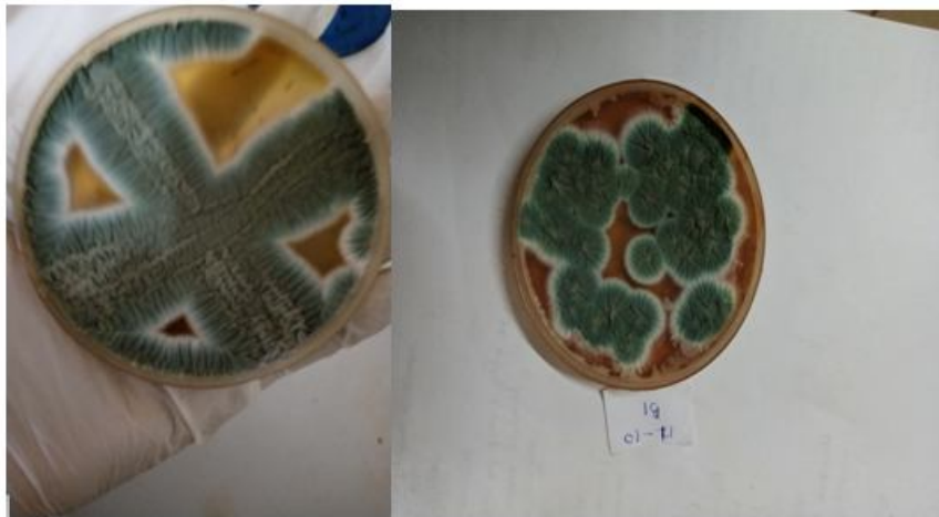
FIGURE 1 Image showing Aspergillus fumigatus on Sabouraud Dextrose Agar