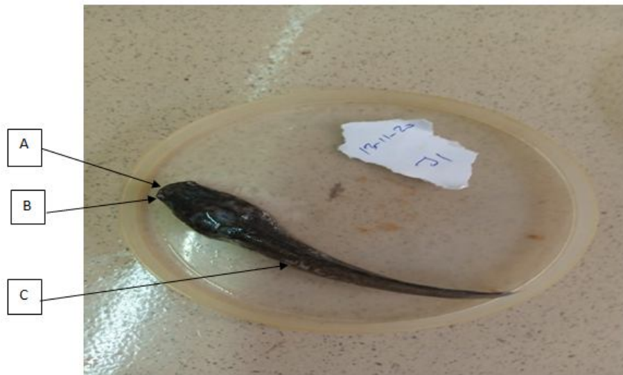
FIGURE 2: Image of Infected juvenile showing atrophied barbel (A), bulgy eyes (B), and Skin depigmentation (C)

Comment [G8]: arrow is not on eye and bulging is not clear