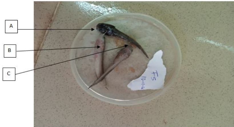
FIGURE 3: Image of Infected fingerlings showing exophthalmia (A), skin discolouration (B), and atrophied barbel (C)

Comment [G9]: we need magnified and clear photo