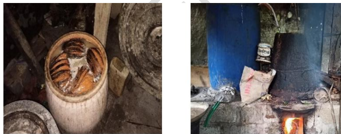
Fig 2. Stages of Fermentation and Distillation of Coconut Nira into Arak Bali

Traditional alcoholic beverages made traditionally generally cannot produce a uniform and standardized product [17]. Figure 2 presents the two main stages in the manufacture of Arak Bali , namely the coconut sap fermentation process, and the traditional distillation process of sap into Arak Bali .