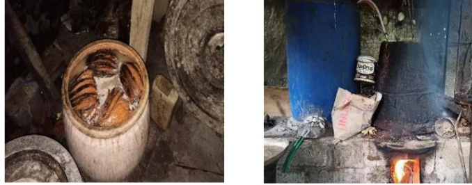
Fig 2. Stages of Fermentation and Distillation of Coconut Nira into Arak Bali