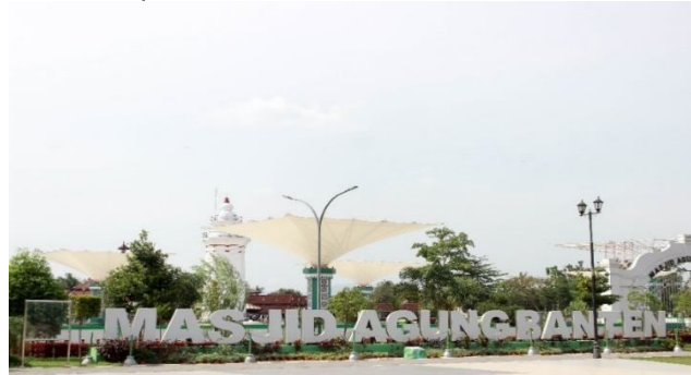
Fig. 3. Great Mosque of Banten

The Great Mosque of Banten was founded during the reign of Sultan Maulana Hasanuddin (1552-1570), who was the first sultan to rule in the Sultanate of Banten. The Great Mosque is located in the village of Banten Lama, standing west of the square. The main building of the mosque has a traditional design, and is the core or sacred area of the mosque complex. Like other ancient mosque buildings, the Great Mosque of Banten has the characteristics of an ancient Javanese mosque.