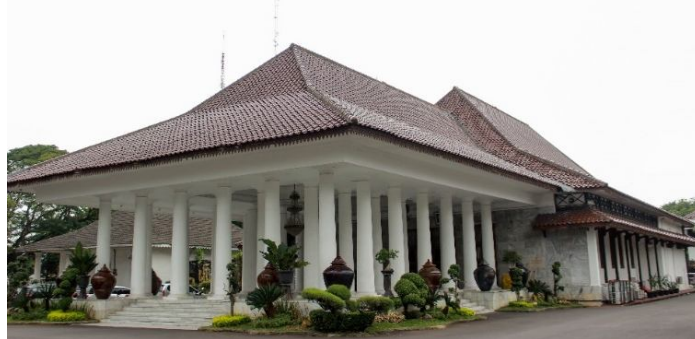
Fig.10. Serang Regent Office Building

porch is supported by 32 Tuscan-style pillars. The roof of the building is pyramid-shaped with wooden construction. The forms of shutters and doors in this building have changed a lot. Initially, the shape of the doors and windows was in the form of double doors and windows with a blinds model. Today, most of the doors and windows have been changed, and replaced with black glass. The changes were made in 2003, in which not only the doors and windows were replaced, but the roof was also replaced with new tiles, and the walls of the building were covered with marble.