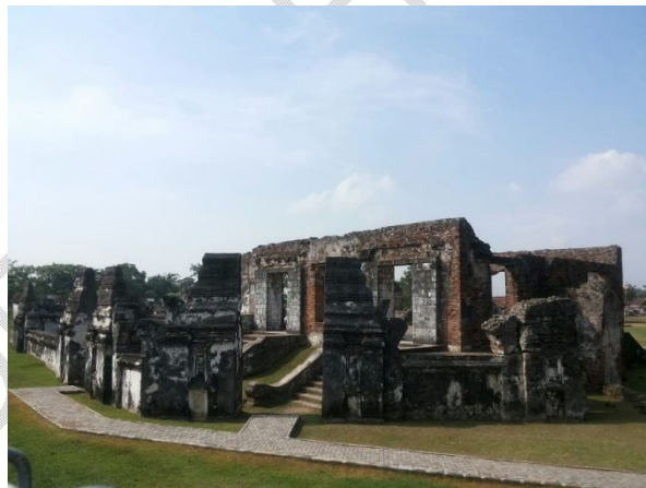
Fig.7. Kaibon Palace

The Kaibon Palace Cultural Heritage Site is the second palace after the Surosowan Palace. The Kaibon Palace is a relic of the Banten Sultanate (Islamic period) which was built in 1815. Judging from its name (Kaibon = Motherhood), this palace was built for the Sultan's mother. Keraton Kaibon is the former residence of Sultan Syafiuddin, a sultan of Banten who ruled around 1809 – 1815. In 1832, the Kaibon Palace Cultural Heritage Site was dismantled by the Dutch East Indies Government, what remained in the form of foundations, building walls and palace gates. The Kaibon Palace building looks more archaic. This can be seen from the architectural form of the gates in the form of a temple.