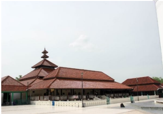
Fig. 4. Tiamah Building

To the south of the mosque building, there is a Tiamah building. This building is rectangular, multi-story, and has an old Dutch architectural style. Apart from the main building and tiamah, also has a mosque minaret, the tombs of the kings of Banten and their families, a pond, and special events. This tower is located on the east side of the Great Mosque or about 10 meters from the pool wall fence. The tower is built with a wall construction with a peak height of 23 meters from ground level, with the base and body on an octagonal plan.