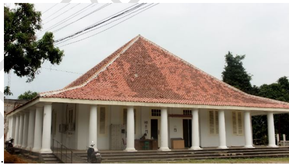
Fig.11. Juang Building

This building has been standing since 1808. It combines several elements of foreign and local cultures. The architecture of the building adapts to the environment and tropical climate of the archipelago the roof of the building is made high, and the eaves are made wide with the resemblance of the building which is very similar to local Javanese buildings. The height of building is made with a very wide roof and porch to adapt to Indonesia's very hot climate. Although there is a mix of local culture, the Juang building still adheres to the Indische Woonhuise architectural style which developed in the mid-18th century to the 19th century.