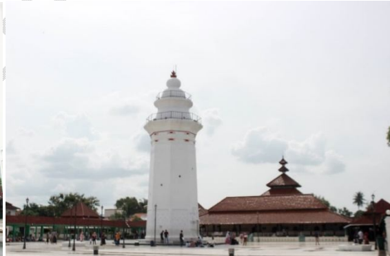
Fig. 5. Tower