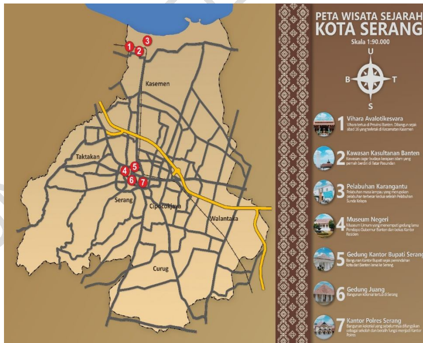
Fig.13. Serang City Historical Tourism Map (First Alternative)

The following picture is the first alternative to the design of the historical tourist map of Serang City. This map contains information on seven historical tours. On the left side is a map and on the right side, there is historical tourist information. The map design is with a brown base color, for the tourist location points are given a number symbol. The main road is marked with a thick black line.