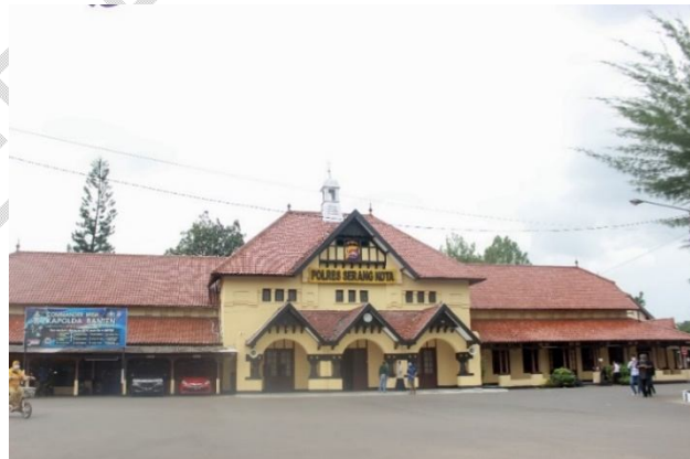
Fig.9. Serang Police Office Building

This building is located on Jalan Ahmad Yani, Serang. This building was originally an OSVIA (Opleidings School Voor Inlandsche Ambtenaren) school building. One of the schools with the highest level ever in Banten until 1910 was OSVIA, a preparatory school for civil service candidates. This building is rectangular. At the front, there is a kind of portico jutting out of three pieces with an arched gate. The roof of the building is in the shape of a pyramid that extends from east to west. On the middle side of the roof, there is a kind of decoration shaped like a ball, and a small rectangular tower with ornate wire poles pointing in all cardinal directions. The roof of the building is composed of wood construction and pottery tiles. The former OSVIA school building still stands majestically today and is used as the Serang District Police Office.