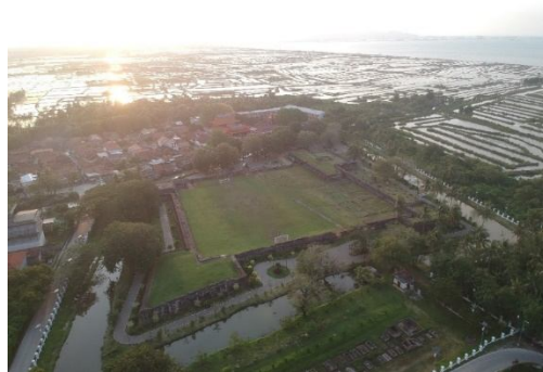
Fig.8. Spelwijk Fort

political clashes carried out by the Dutch, thus sparking a blood war between Sultan Ageng Tirtayasa and his son, Sultan Haji, for the control of the Sultanate of Banten. This fort functioned as a place of Dutch defense, in which there were offices, residences for company officials, and army barracks.