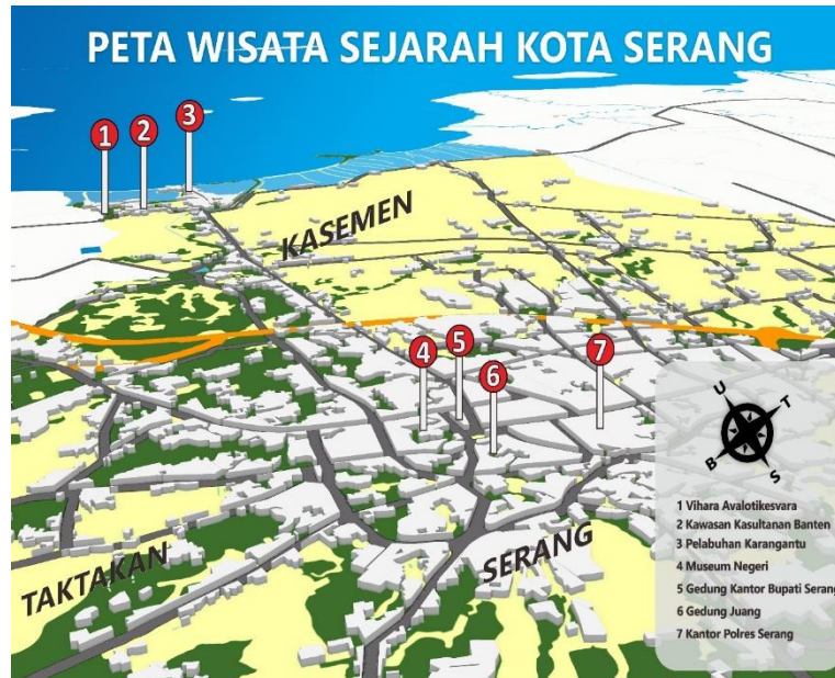
Fig.15. Serang City Historical Tourism Map (Third Alternative)