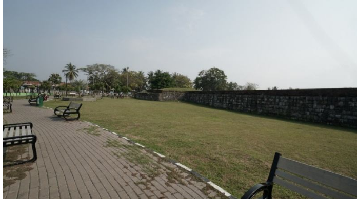
Fig.6. Surosowan Palace