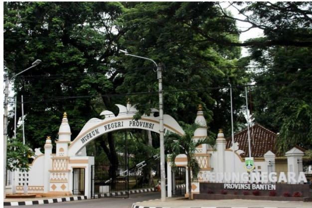
Fig.12. Banten Province State Museum

Resident Office as the location for the Banten Province State Museum is based on the fact that the Banten Resident Office is a cultural heritage building.