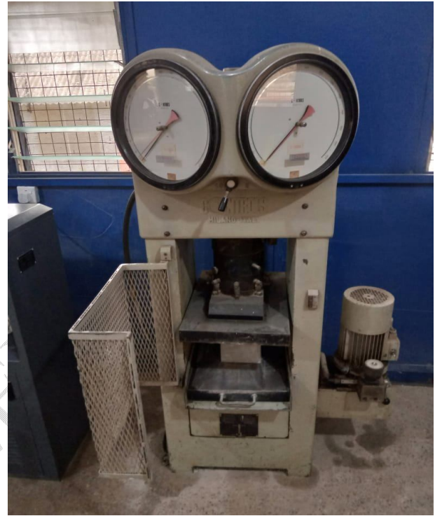
Fig.2 testing of concrete specimen in the test machine.