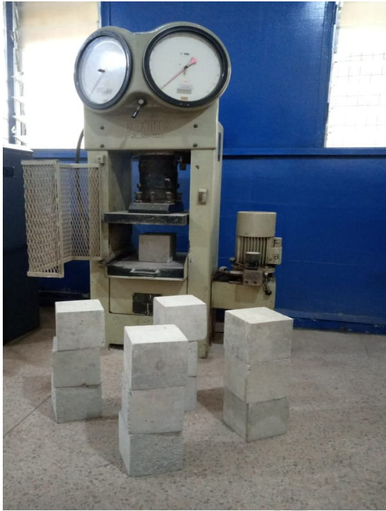
Fig. 1 Concrete test specimens

applied initially to keep the cube in position. The load was then applied to the concrete test cube at a constant rate until failure by crushing. The concrete test cube measured 150 x 150 x 150 mm in accordance with the requirements of ASTM C39/C39M-2020 standards. The concrete cubes were cured in the laboratory at a temperature of 37°C and relative humidity of 100% prior to testing.