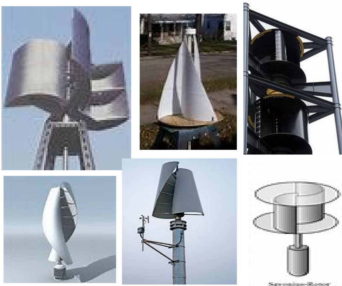
Figure 2: Various designs of Savonius Vertical Axis Wind Turbine [18]

There are several previous and ongoing types of research to improve the performance of the Savonius rotor. These researches include: