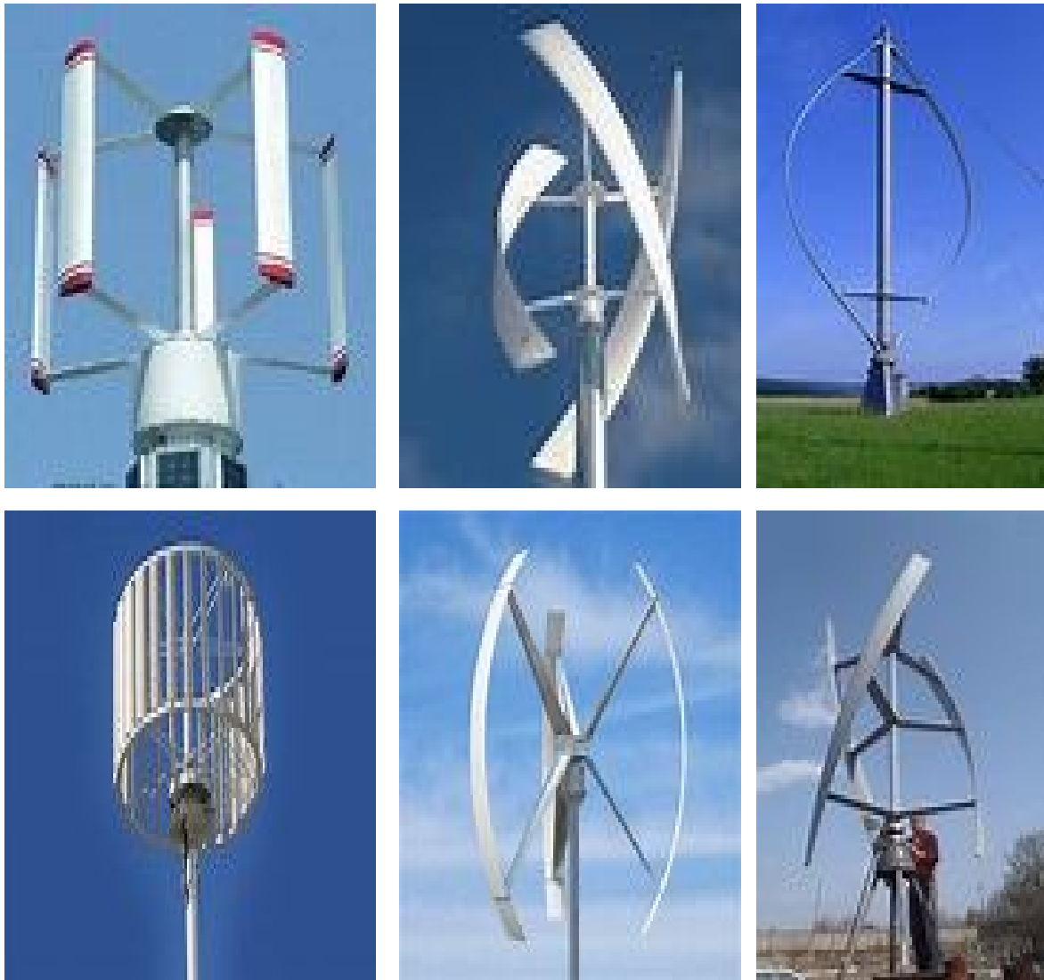
Figure 3: Images of Darrieus Blade Vertical Axis Wind Turbine [63]