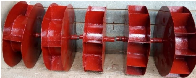
Fig.1.The Turbine Runners used for the study

A support made of 2 × 2 mm angle iron was provided for the turbine at the foot of the stanchion directly beneath the penstock. The support is firmly held in place with concrete with adequate clearance to allow the free rotation of the turbine wheel. Adequate provision was made to channel the water back to the underground reservoir and a fitting protective cover was used to prevent water splashing during the operation of the system and to serve as a guide for the nozzles. Two bearings matching the shaft diameter are provided at the ends of the support on which the turbine runner is mounted. Figure 2 shows a CAD produced exploded view of the set up without the reservoirs and the piping.