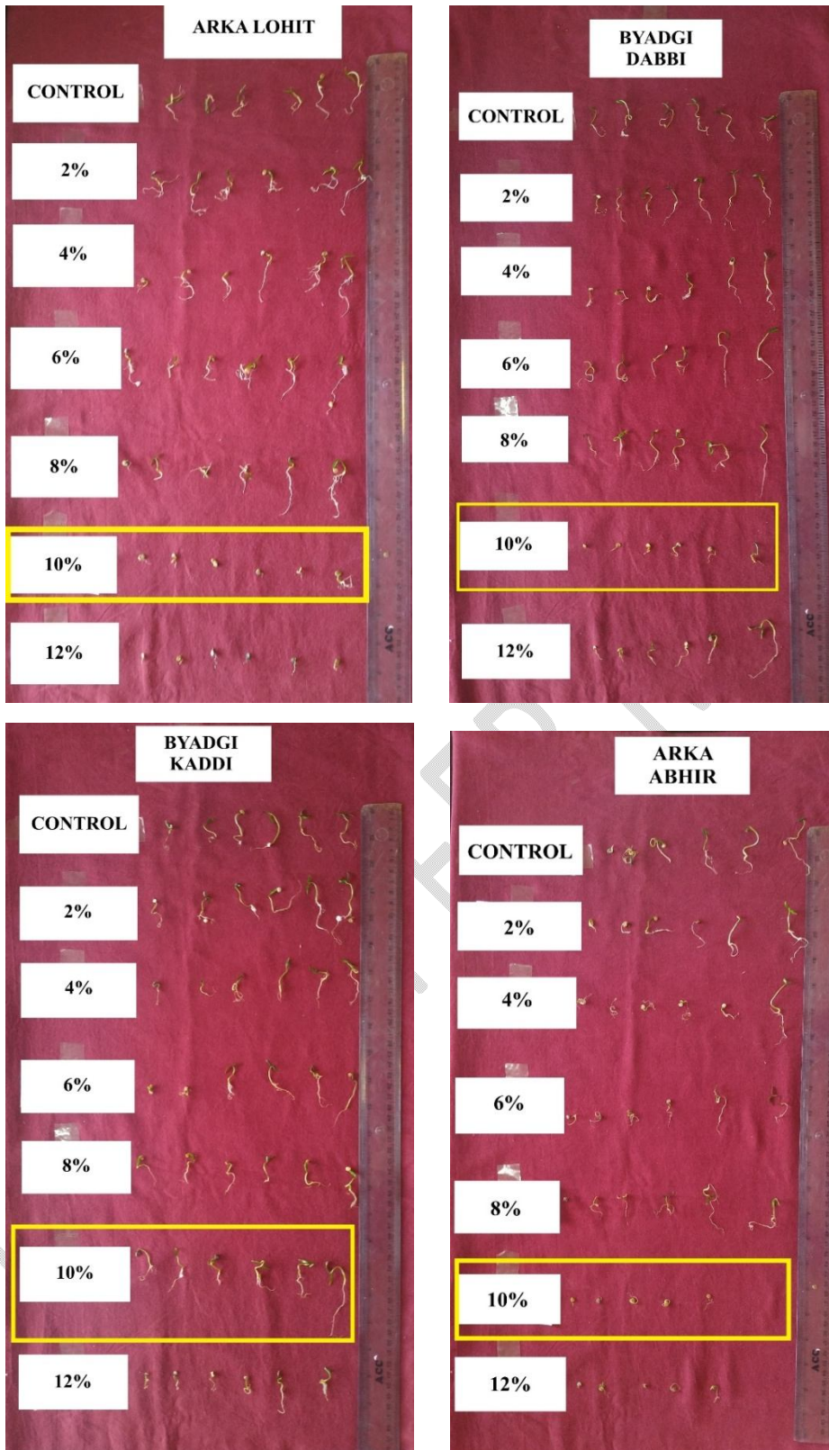
Plate 2. Root length (cm) and shoot length (cm) in control and at different PEG concentrations in four chilli genotypes