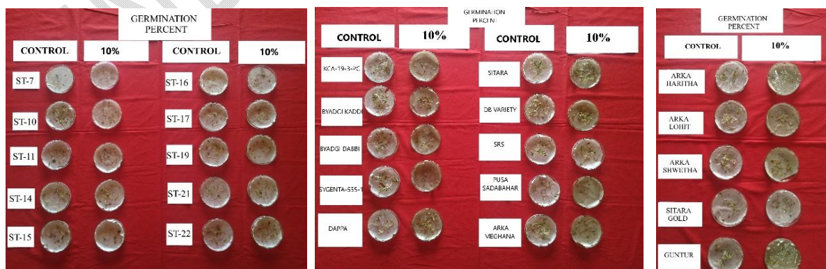
Plate 4. Germination percentage of chilli genotypes in distilled water and 10 % PEG-6000

The shoot length ranged from 10.18 to 12.58 under control conditions and from 5.16 to 12.42 under 10 per cent PEG concentration. The lowest mean root length under both conditions were seen in ST-15, ST-10 and ST-21 and the highest was seen in Arka Lohit, Dappa and DB variety (Table 5 and Plate 4). The shoot length decreases as the PEG concentration increases due to reduced cell elongation and low water potential created by PEG. Similar results were reported earlier by many researchers [18] [17] [19] [20] [16].