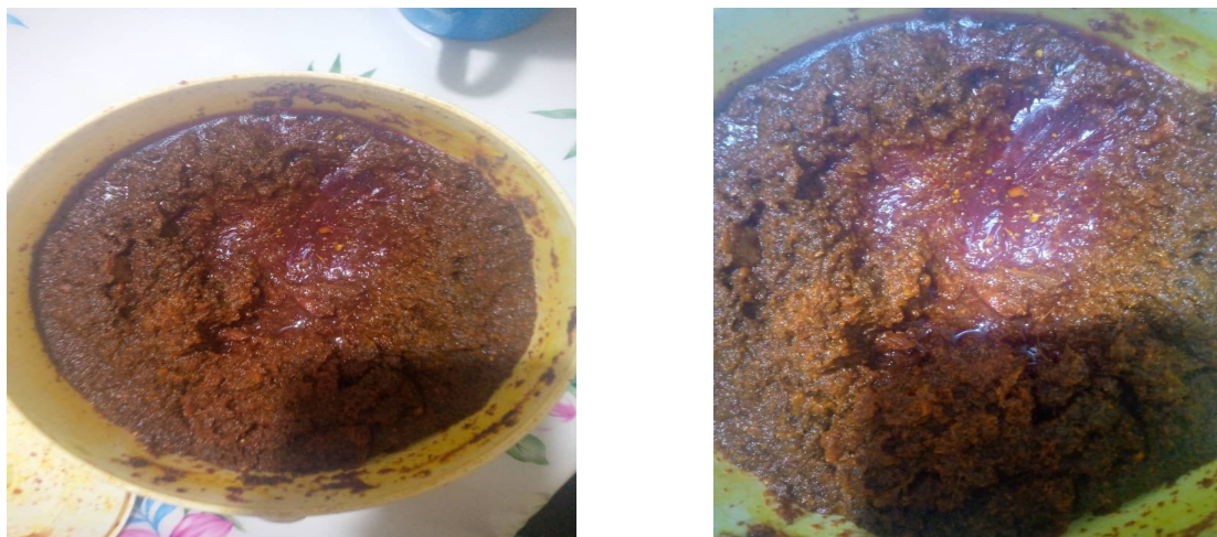
Fig. 3 : The variant of PdeluxeKK