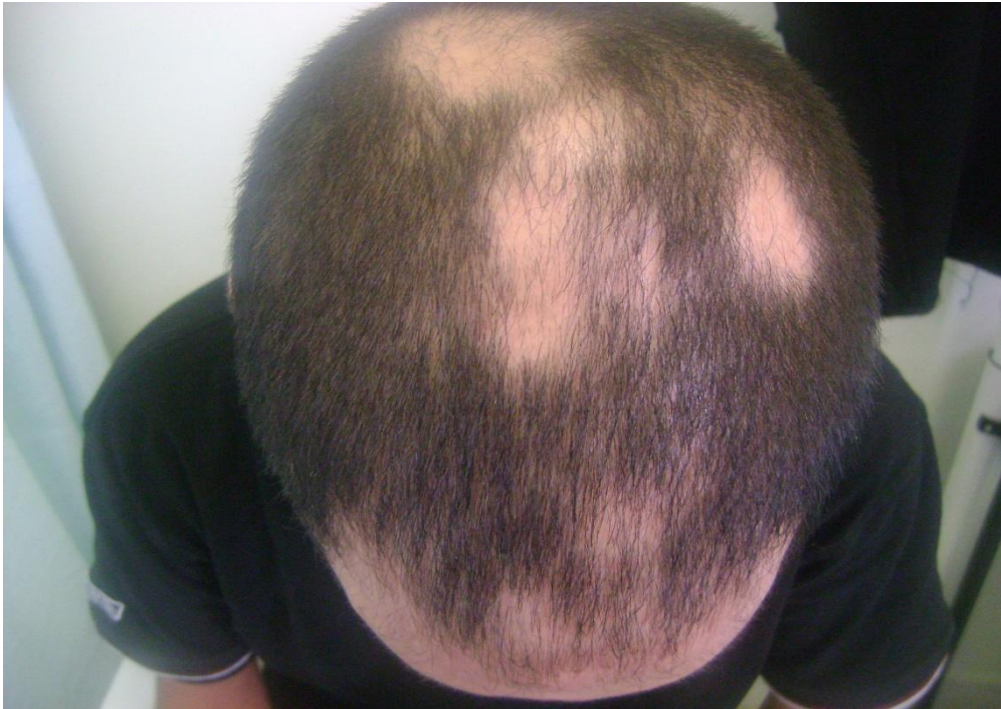
Figure 2: Patchy alopecia areata ( multiple ).