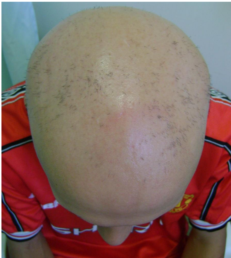
Figure 5: Alopecia totalis.