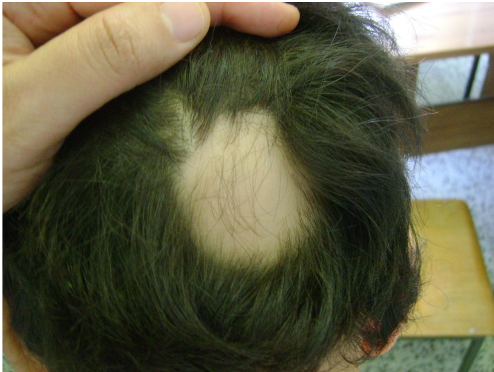
Figure 1: Patchy alopecia areata ( single ).