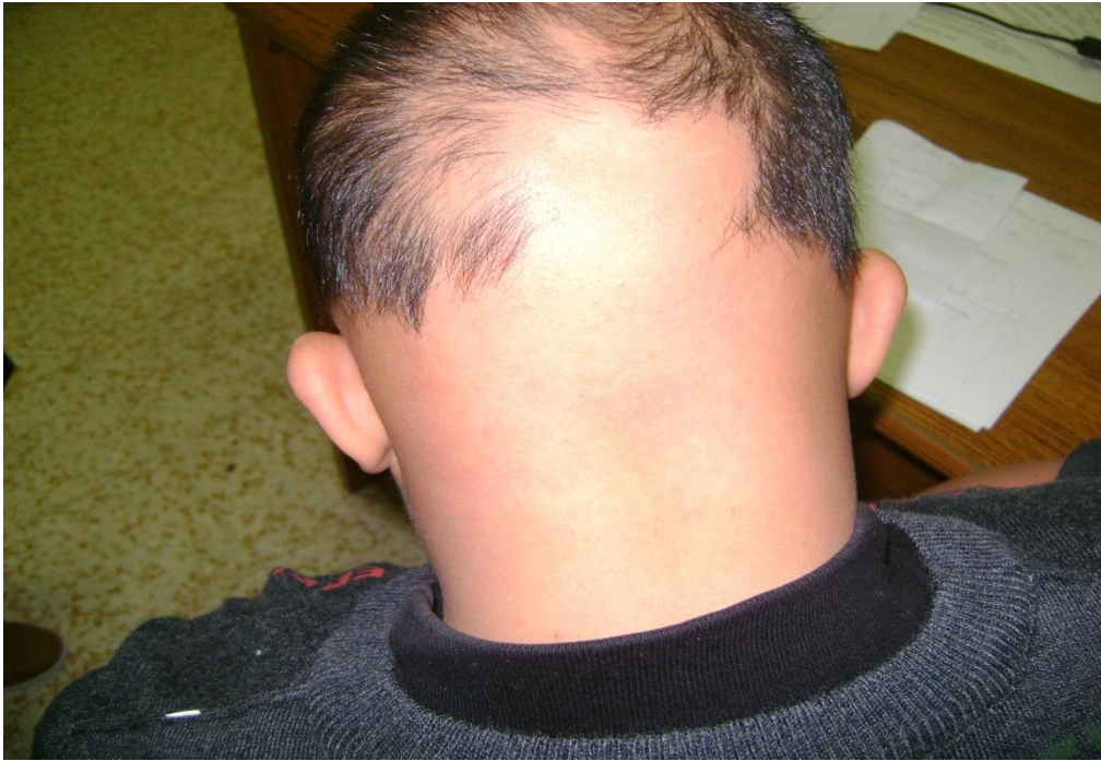
Figure 4: Patchy alopecia areata and ophiasis in Dawn's syndrome patient.