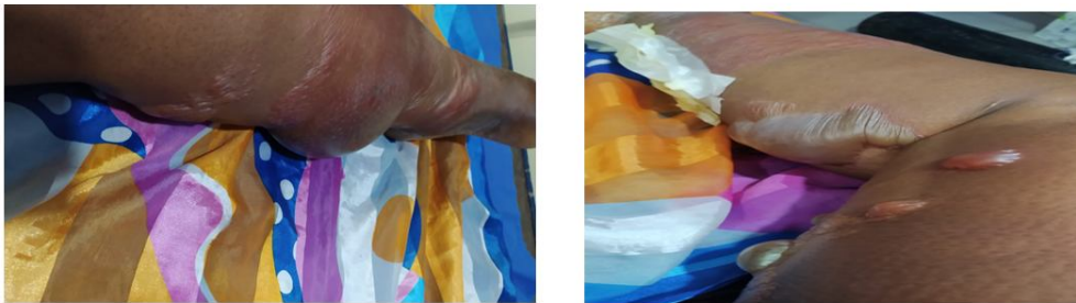
Figure 1 shows multiple hyperemic fluid filled skin lesions of varying sizes on both lower limbs.

A patient aged 29 years, without any history of chronic medical conditions, presented with a history of sudden onset of pain in both lower limbs, colicky abdominal pain, 4 episodes of passage of loose stool, and 8 episodes of non-projectile, non-bilious vomiting, evolving in the context of fever which subsided with use of antipyretics. The physical examination found a febrile patient (Temperature was 38.9°C), conscious, alert, and in painful distress. Multiple, hyperemic, bullous skin lesions of varying sizes sparing the soles of the feet were noted in both lower limbs with edema up to the thighs bilaterally with differential warmth. (Figure 1)