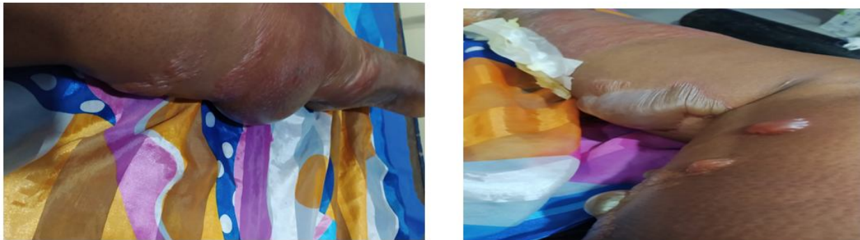
Figure 1 shows multiple hyperemic fluid filled skin lesions of varying sizes on both lower limbs.

A patient aged 29 years, without any history of chronic medical conditions, presented with a history of sudden onset of pain in both lower limbs, colicky abdominal pain, 4 episodes of passage of loose stool, and 8 episodes of non-projectile, non-bilious vomiting, evolving in the context of fever which subsided with use of antipyretics. The physical examination found a febrile patient (Temperature was 38.9 0 C), conscious, alert, and in painful distress. Multiple, hyperemic, bullous skin lesions of varying sizes sparing the soles of the feet were noted in both lower limbs with edema up to thighs bilaterally with differential warmth. (Figure 1)